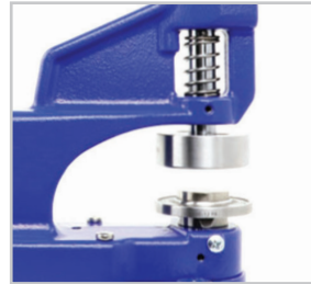
4 1/4" Throat Depth