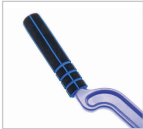
Handle Designed for 50% Less Effort

Included with this unit is the most popular #2 grommet die. (Order #12 tooling to make 1½” holes for door hanger sell cards.) Optional alignment tool available to help with accurate spacing if needed.