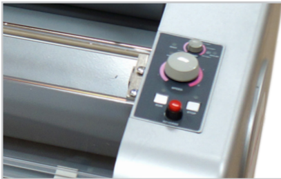
Control panel with adjustable heat and speed control. Reverse switch.

The Duralam Integra™ Eco-Load Laminator is feature packed. We all know how valuable time is—the Duralam Integra shines with 5 minute warm up and capacity to handle up to 1000' rolls—double the roll length; half the load time. Industry first—variable auto-shut off function. Safety switches on all key components and hidden adjustable tension control for that extra piece of mind. Other outstanding features include variable speed with an ultra slow speed setting for easy feeding of small projects and less wastage. Extra long 13' power cord and rear slide cutter finishes off this smart packaged design. Upgrade your purchase with available options: extended warranty plans, safety power lock, rolling cart with bottom shelf and locking castors, footage counter, and premium low melt films.