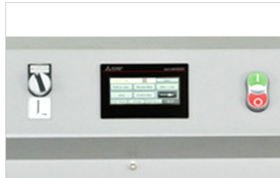
Touch Screen and Safety Controls