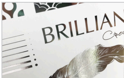
SleekerDigital™ Technology bonds metallic foils, spot gloss and holographic effects to digital print.

The ExcelTopic-380™ is a compact on-demand single-sided specialty finishing system. With maximum sheet size capabilities up to 15"W x 31.5"L this unit is an excellent complement for any print engine on the market today. Adjustable de-curling system creates consistently flat output and the automatic separation system ensures perfectly separated sheets. SleekerDigital™ comes standard with this laminator, technology that bonds to digital output presenting a vast array of finishing options including variable data spot foiling, spot gloss, and spot holographic special effects. The high pressure nip roller system on this laminator gives superior results to most comparable machines with spring pressure roller systems. The ExcelTopic-380™ outstanding versatility, ease of use, and ability to add value to print has never been easier and more economical.