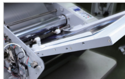
Semi-Automatic feeder, and automatic sheet separator.