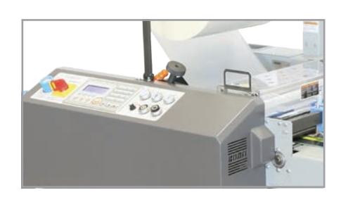
Centralized Control Center