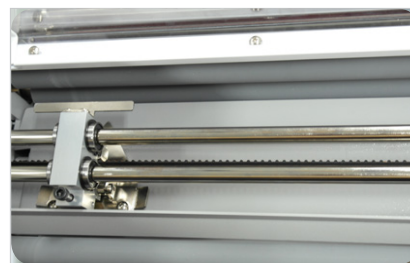
Flying Knife Sheet Separation