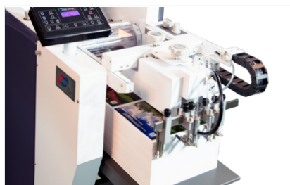
Deep Pile Fully-Automatic Feeding Head is Optional

The PODTOPIC-380RZ single-sided laminator is a specialty finishing system that meet the needs of on-demand print shops as an excellent complement for most digital print engines. This unit comes standard with semi-automatic feeder, or an optional deep pile fully-automatic feeding head is available. Unique flying knife sheet separation, works excellent with all feeding types including nylon. The PODTOPIC-380RZ has an adjustable de-curling system that creates consistent flat output. The PODTOPIC-380RZ is capable of both laminating as well as SleekerDigital™ finishing technology which allows for variable data foil stamping, spot varnishing and holographic effects on digital outputs. The PODTOPIC-380RZ is the professional and economical addition for in-house on-demand lamination and specialty finishing.