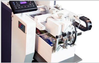
Deep Pile Fully-Automatic Feeding Head Option

The QTopic-380F single-sided laminator is a specialty finishing system that meet the needs of on-demand print shops as an excellent complement for most digital print engines. This unit comes standard with semi-automatic feeder, or an options is available with a deep pile fully-automatic feeding head. The QTopic-380F has an adjustable de-curling system that creates consistent flat output. The QTopic-380F is capable of both laminating as well as SleekerDigital™ finishing technology which allows for variable data foil stamping, spot varnishing and holographic effects on digital outputs. The QTopic-380F is the professional and economical addition for in-house on-demand lamination and specialty finishing.