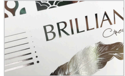
SleekerDigital™ Technology bonds metallic foils, spot gloss and holographic effects to digital print.