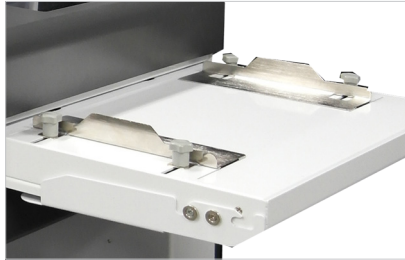
Paper Feed Guides