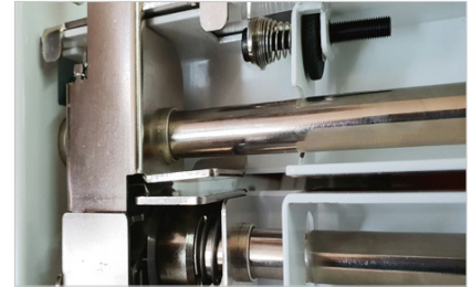
Paper Feed Guides