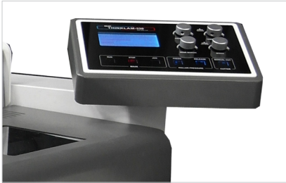
LCD Control Panel Operation

The ThinkLam-330™ is a fully automatic POD laminator with LCD control panel, delivering crystal clear, scratch-free double-sided lamination with flush trim and sealed edges on all four sides. This easy-to-use unit boasts reliable automatic feeding, laminating and cutting systems along side its ability to detect laminate thickness and determine precise temperature and speed for each job. Use ThinkLam™ roll laminates and enjoy simplified loading with an anti-opposite film loading system and clam shell type feeding table. This unit is a valuable addition to any print shop and perfect for on-demand short run jobs.