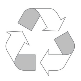
Ecological, Space-Saving & Economical.