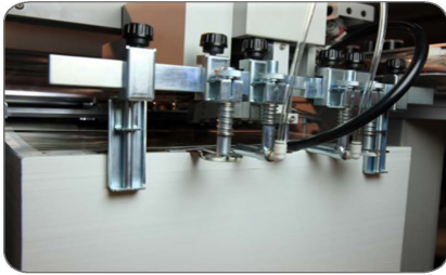
Auto Paper Feeding Option

PROTOPIC AUTO - 540 includes air compressor & low noise vacuum pump. Stream feeder installed for auto paper-feeding. Perfect lamination without bubbles for all kinds of paper quality. High pressure of PROTOPIC AUTO - 540 laminating roller for enhancing quality of laminating results. Well-streamlined function adjustment by use of capacitive type touch-screen. Function of various information for user-friendly convenience. PROTOPIC AUTO - 540 is one unified machine design including cabinet for easy storing air-compressor & vacuum pump.