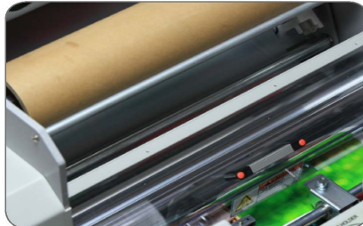
High Glossy Chrome Plated Roller