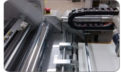
Automatic Gap Adjustment For Feeding Paper