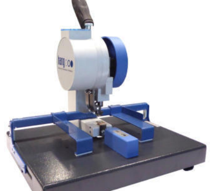
Model 102-10 / 102-14