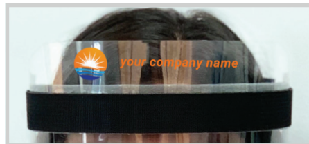
Company Name on Clear Sticker

Ask your sales rep. about branding options for your unique requirements.