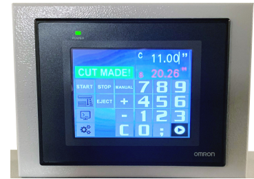
User Friendly Touch Screen