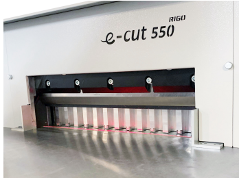
Robust back gauge

Our top selling digital sized cutting machine is built in Hungary at the renowned Rigo manufacturing plant. Omron PLC with advanced computing power allows for programmed cutting operations. Highly technical AC power drives sets these in a class of their own. Engineered with high strength welded steel and machined aluminum ensures the cutter is strong and accurate. Adjustable clamp pressure from the touch screen ensures every job is handled with the finest touch. Back gauge is equipped with double screw for the most accurate and stable back gauge in this category. Optical cutting line, false clamp and blade change tool kit included. Side tables can be removed for small work spaces.