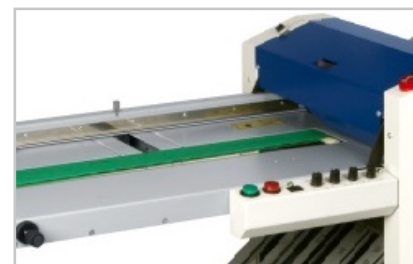
Transport table & control panel with regulation buttons