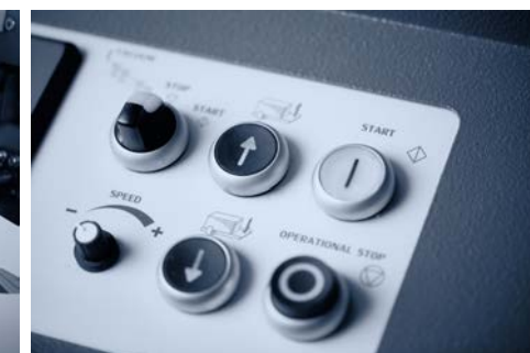
Easy to operate