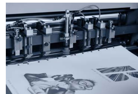
Precise feeding system