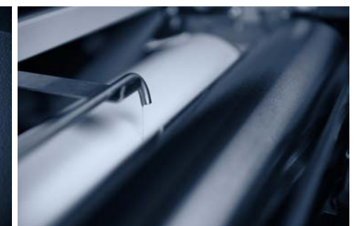
3-rollers application system