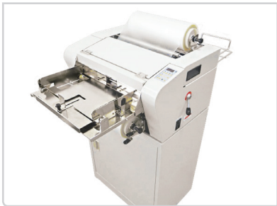
Revo-T14 shown with cabinet/stand. Hinged door keep supplies and film conveniently stored.