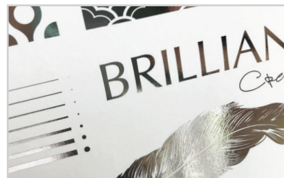
SleekerDigital™ Technology bonds metallic foils, spot gloss and holographic effects to digital print.